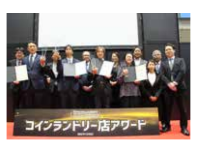
The prestigious 8th Annual Laundromat Awards will be held during the show.

In Japan, laundromat business is developing in its unique ways over past decades, reaching 25,000 stores nationwide. The huge market has been growing continuously with a new wave as represented by laundromat IoT technology, cutting-edge self-operating system and combining with cross-industrials. Take advantage of this opportunity to showcase the latest products and services for exploring the latest laundromat market in the Asia region.